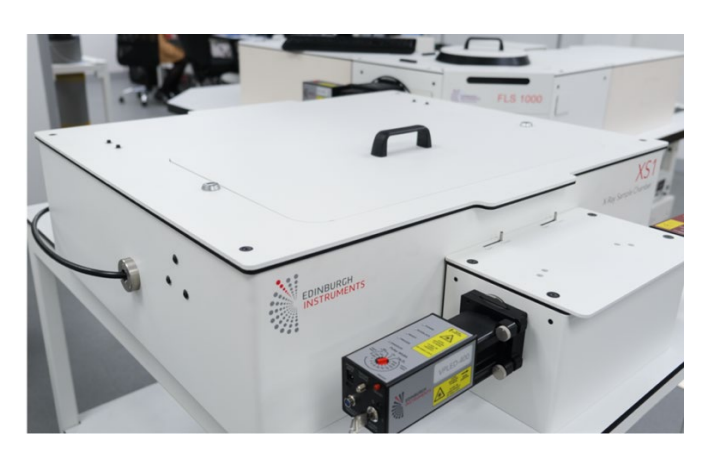
Figure 1 Edinburgh Instruments XS1 RL chamber.

Batches of CsPbBr<sub>3</sub> NCs were synthesised with different volumes (0.0, 0.05, 0.1, 0.2, 0.4, 0.8 mL) of an oleylamine (OAM) surfactant and were named accordingly (OAM 0.0, OAM 0.4 etc.). NCs were then loaded into poly(methyl methacrylate) (PMMA) plastic discs at a range of concentrations (1, 2, 4, and 10%). RL emission of the CsPbBr<sub>3</sub> NCs / PMMA discs was measured with an FLS1000 spectrometer and XS1 RL chamber (Figure 1). Steady-state RL emissions of the samples were measured under excitation by a 60 kV X-ray with a tube current of 100 \mu A. Time-resolved RL decays were acquired using TCSPC with a laser-excited 40 kV pulsed X-ray source.